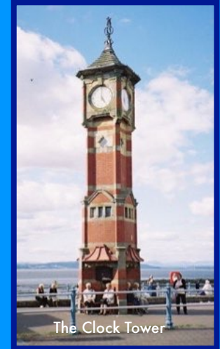
The Clock Tower

OS map: © Crown copyright Lancashire County Council licence № 100023320