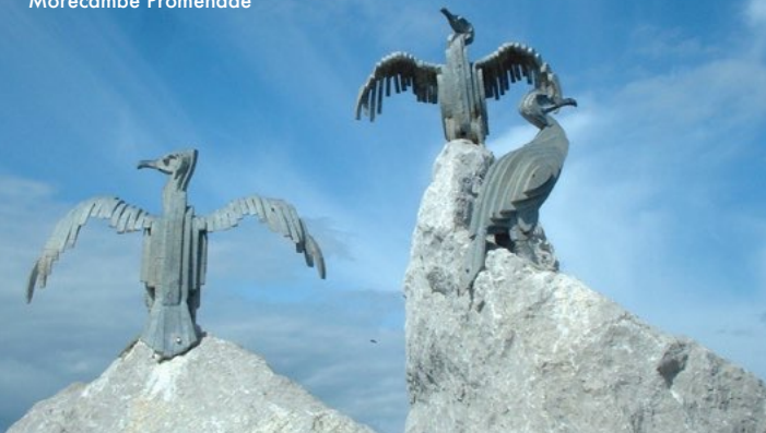
Cormorant Sculpture, Morecambe Promenade

This leaflet describes one of a diverse collection of twelve walks linking neighbouring stations along the Bentham Line between Heysham Port and Skipton.