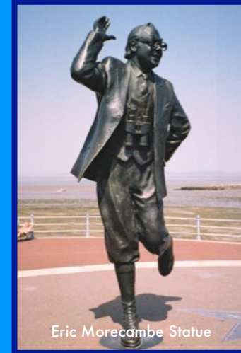
Eric Morecambe Statue