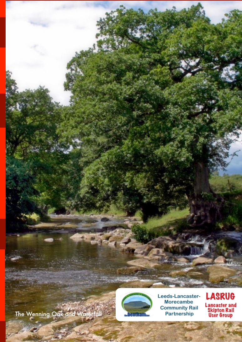
The Wenning Oak and Waterfall